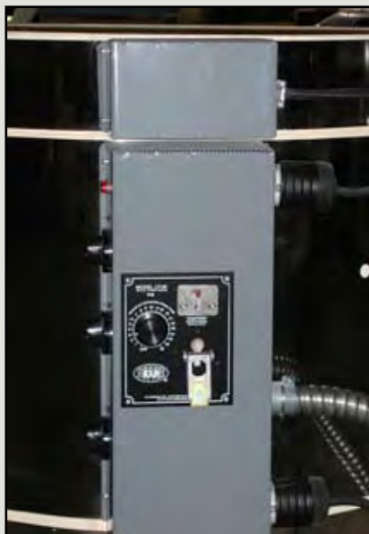
Detach screws from kiln sitter plate