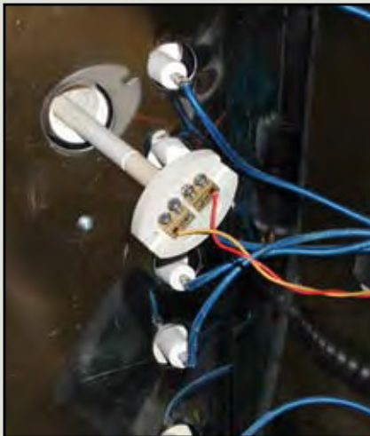
Insert thermocouple through kiln sitter hole