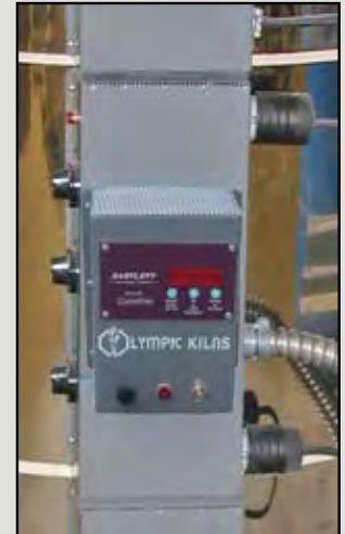
Install electrical box back on kiln with Electro Sitter installed.

Read the electronic controller instruction manual that accompanies your Electro Sitter. Turn switches to HIGH. Program your Electro Sitter and begin many happy firings!