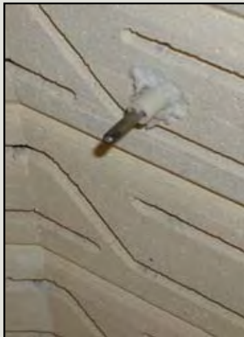
Thermocouple will show through brick wall at a maximum of 1". Pack kiln sitter hole with ceramic fiber to seal it.