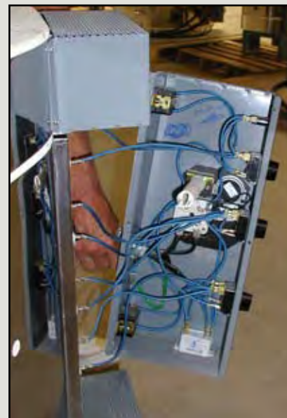
Remove wires from back of kiln sitter terminal block