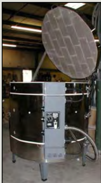
Kiln with kiln sitter

Electro Sitter will replace your obsolete kiln sitter model! It's easy, and best of all, parts are available! The Electro Sitter box is complete with thermocouple attached, and it has the option to fire either cone or ramp programs. The box will fit where the kiln sitter/timer are attached to the kiln. Simply remove the screws from the kiln sitter on front of the kiln, then detach wires connecting to the kiln sitter. Wires will be attached to the back of the Electro Sitter exactly as they were attached to the kiln sitter terminal block.