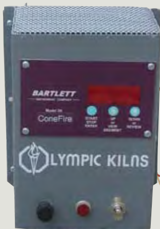
3 Key-Cone Fire