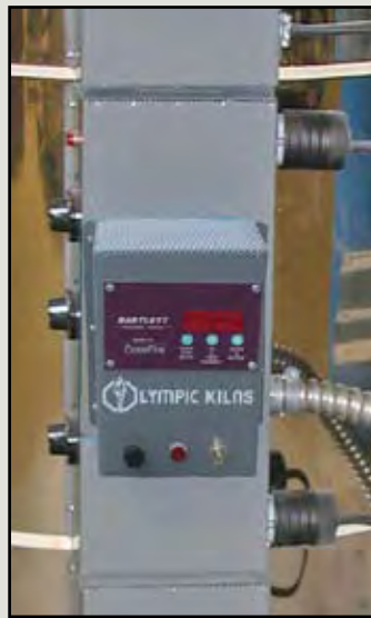
Install Electro Sitter in the same location as the former kiln sitter plate.