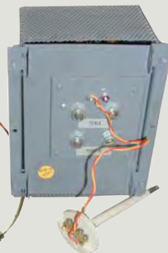
Back of Electrical Box for Electro Sitter

Electro Sitter will replace your obsolete kiln sitter model! It's easy, and best of all, parts are available! The Electro Sitter box is complete with thermocouple attached, and it has the option to fire either cone or ramp programs. The box will fit where the kiln sitter/timer are attached to the kiln. Simply remove the screws from the kiln sitter on front of the kiln, then detach wires connecting to the kiln sitter. Wires will be attached to the back of the Electro Sitter exactly as they were attached to the kiln sitter terminal block.