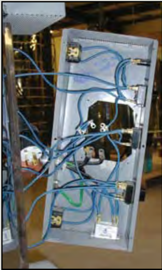
Electrical box without kiln sitter